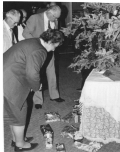
Gift exchange at the SCCARA Christmas Party.